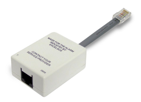
Z-BLOCKER® Z-A431PJ31X Alarm Panel DSL Filter