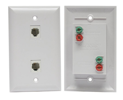
CP-V413PS VDSL2 Video-Grade CPE Splitter

The CP-V413PS Video-Grade CPE Splitter is one of many splitters and filters manufactured by Excelsus, a brand of Pulse, for digital services within homes, offices, and hotels. Excelsus is the number one selling brand of DSL filters and splitters worldwide.