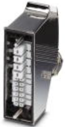
Sleeve housing, with EMC coating, metric

Please be informed that the data shown in this PDF Document is generated from our Online Catalog. Please find the complete data in the user's documentation. Our General Terms of Use for Downloads are valid ( http://phoenixcontact.com/download )